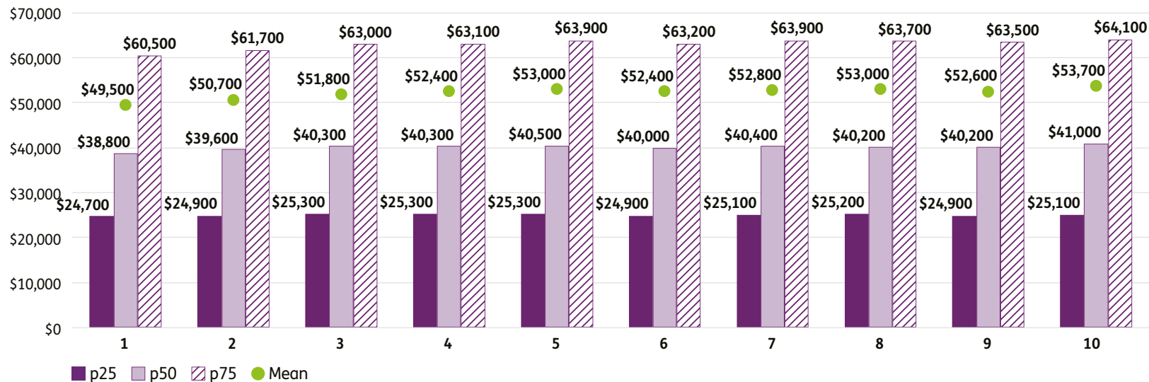
Figure 2: Standardised plan budgets by IEO deciles – non SIL, age 0-64 –30 June 2021 – 25th percentile, 50th percentile, 75th percentile and mean

Further, the difference between the average (mean) standardised plan budget for participants in the tenth decile is $53,700 compared with $49,500 in the first decile (a difference of 8%). This is broadly consistent with the difference when plan budgets were not standardised for age and functional capacity.